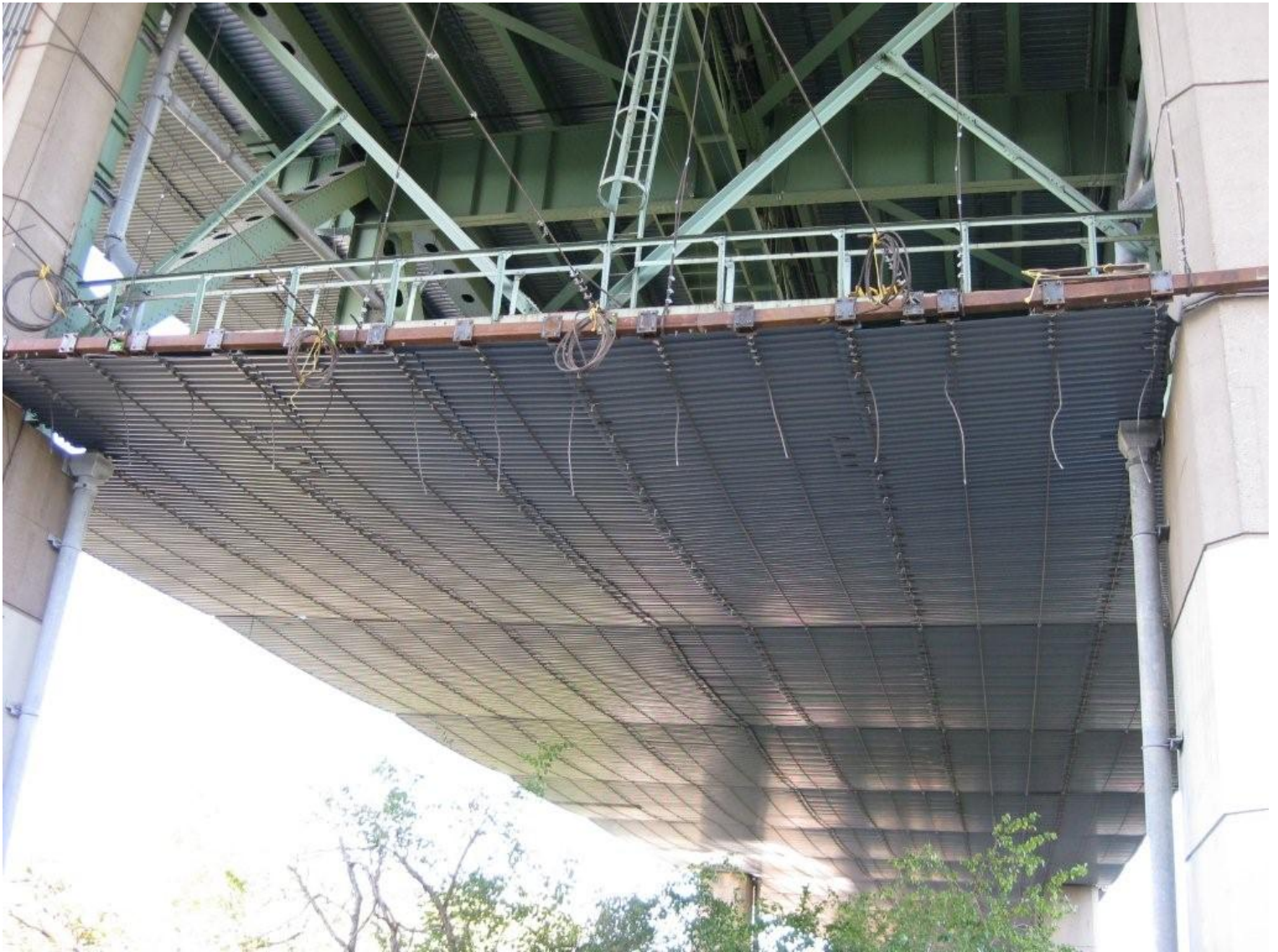
Lower Cable Supported/Metal Deck Platform & Horizontal Support Beam Assembly End Connection - Anchor Span