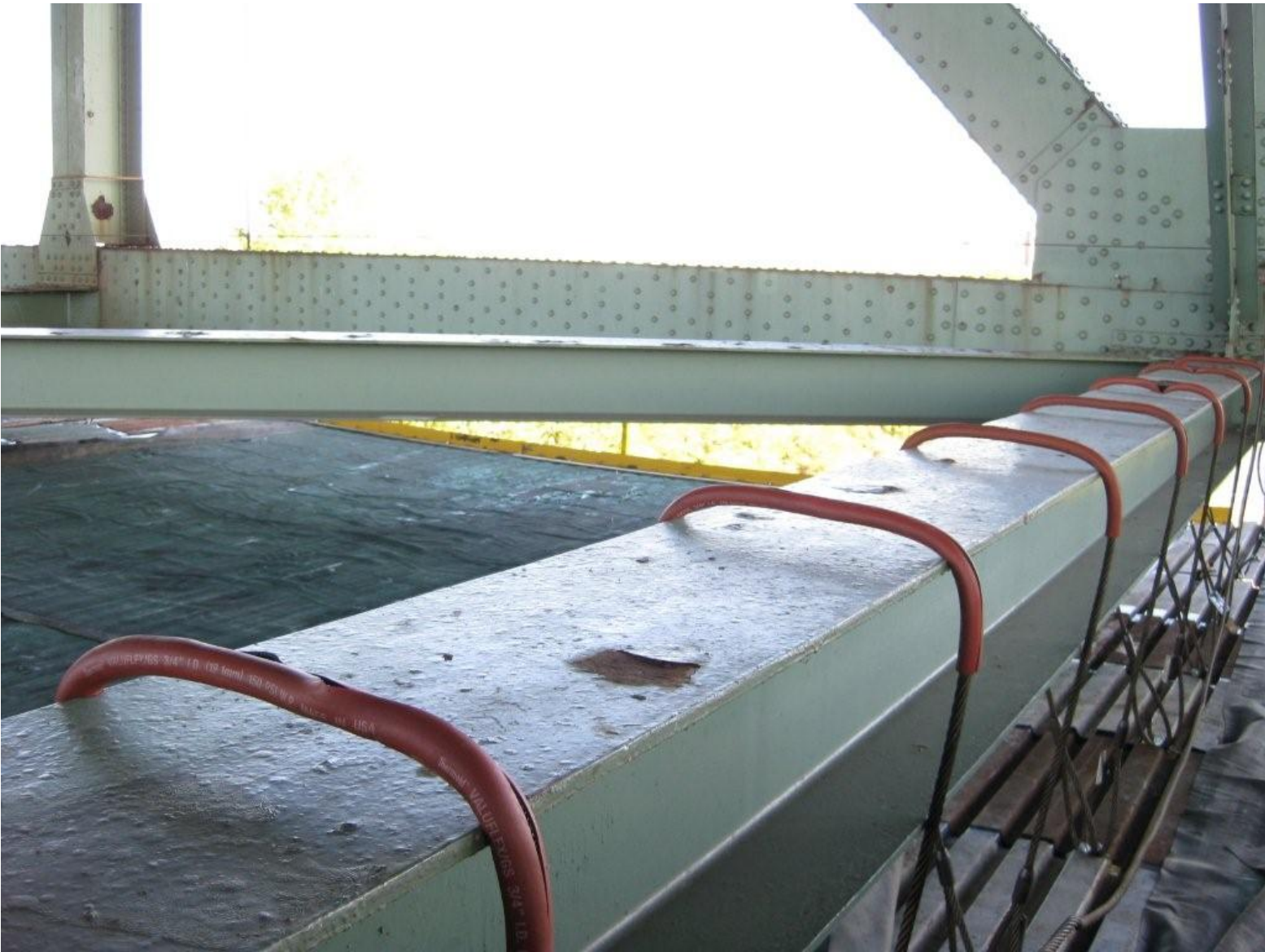
Lower Cable Supported/Metal Deck Platform Tie Ups Supported From Lateral Bracing Anchor Span