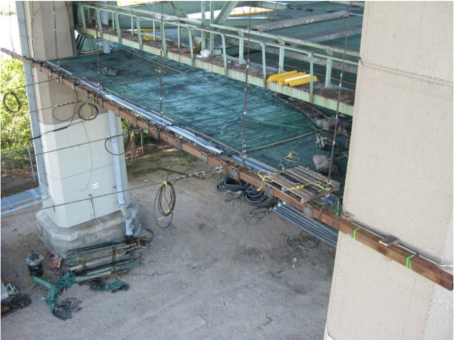
Lower Cable Supported/Metal Deck Platform & Horizontal Support Beam Assembly End Connection w/Beam Tie Back Assemblies Anchor Span