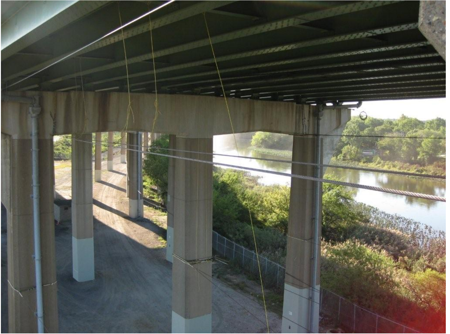
Main Cable Installation - Approach Spans