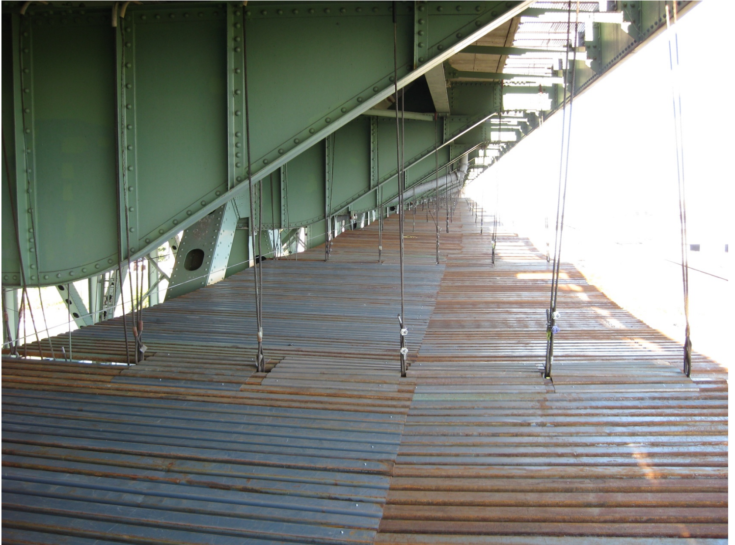
Cable Supported/Metal Deck Platform System – Upper Level Anchor Span