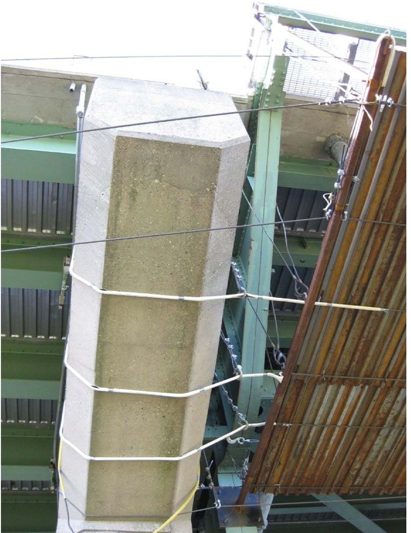
Upper Main Cable End Connections Wrapped Around Pier & Tie Back Assemblies