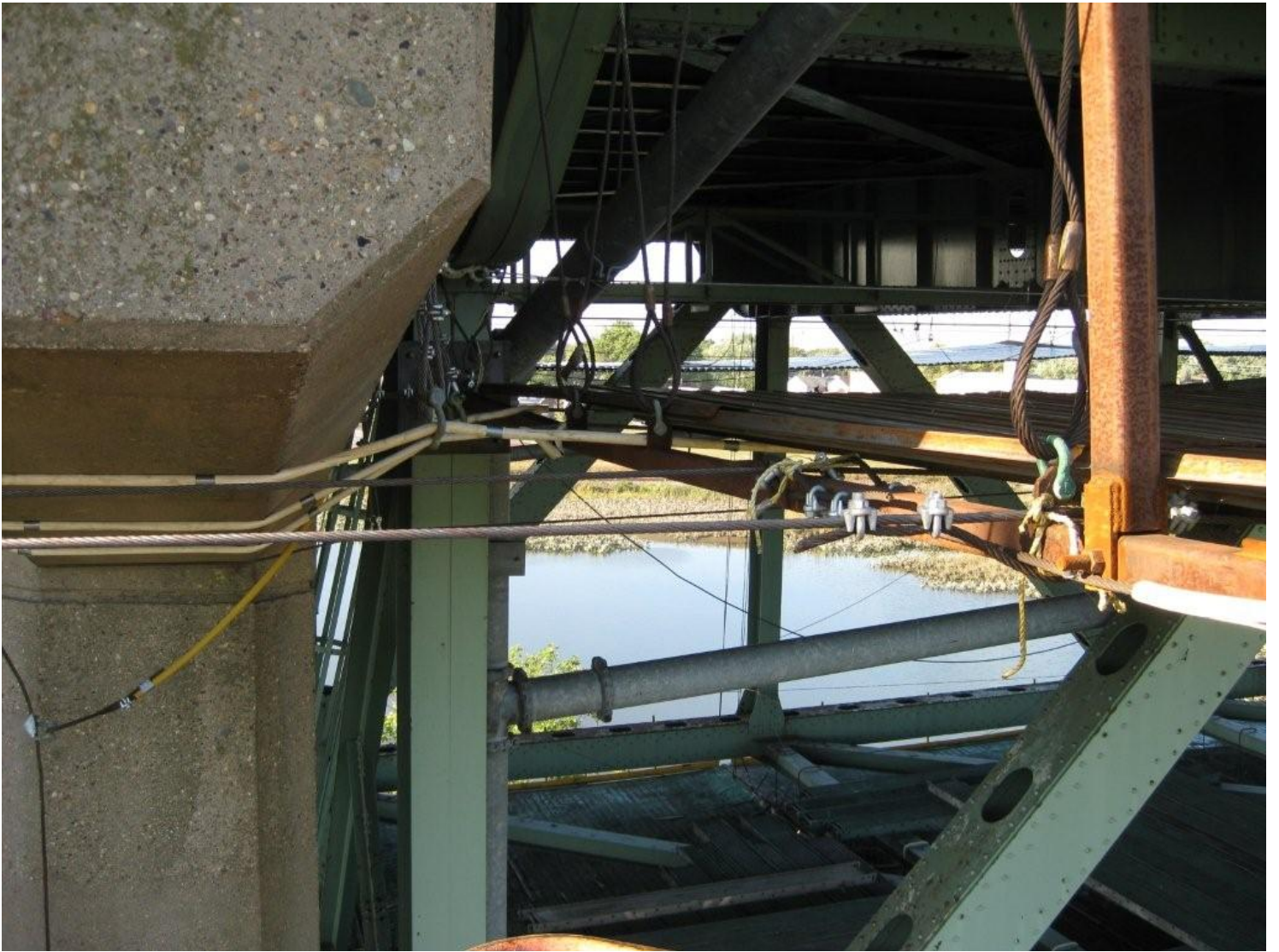
Cable Supported/Metal Deck Platform System – Upper & Lower Levels Anchor Span