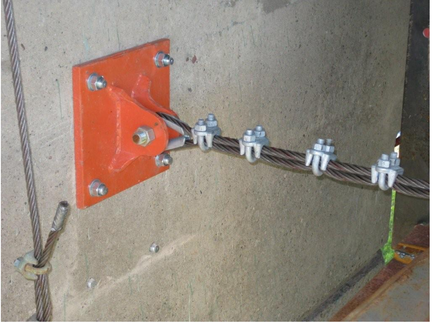
Anchor Plate End Connection Assembly Installation Anchor Span